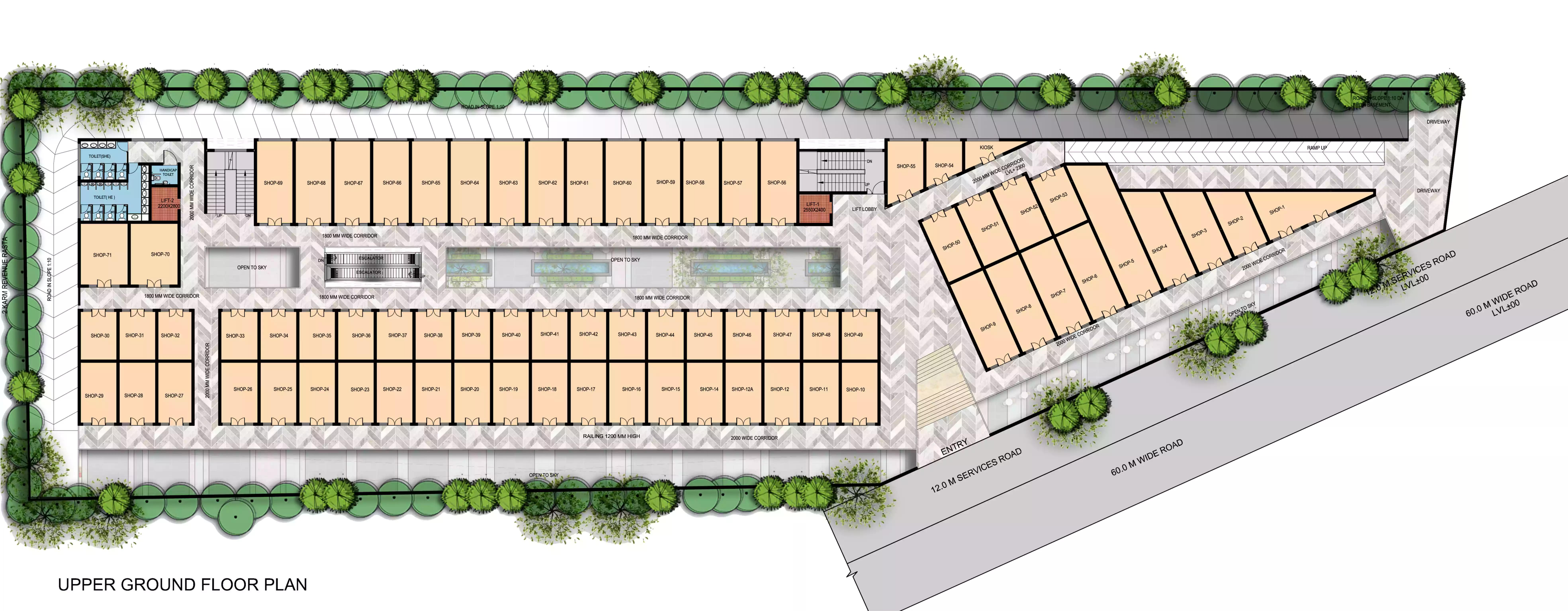
UPPER GROUND FLOOR PLAN